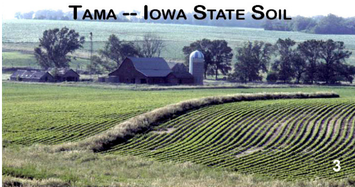
Fig. 3 The Tama soil is rich in nutrients and ideal for agriculture.

Soils that have very favorable properties for growing grain, feed, and fiber production often have few limitations for non-agriculture uses. Tama soil properties are ideal for residential and small commercial building development. These favorable properties include the high silt content of the Tama parent material, its depth to less desirable parent materials, and being well-drained. Tama soils also have low to moderately low shrink-swell potential which can cause the foundation of buildings to crack. The use of the Tama soil for basements, sidewalks, driveways, parking lots, on-site waste treatment and playgrounds require less engineering and remediation compared to many other soils types. (Figure 2)